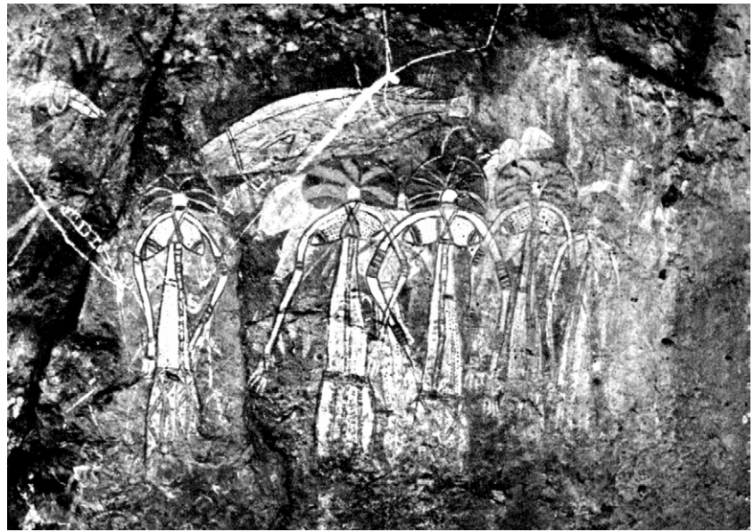
Figure 3. A section of the Anbangbang Gallery in 1962 taken during filming for the BBC documentary Quest Under Capricorn (after Attenborough 1963).

Just two years before Edwards began recording rock art in this region, an extended Aboriginal family camped in the Anbangbang Gallery and produced one of the most visually stunning and significant series of paintings that exists within Kakadu. These paintings represent the most recent layer of art in this rockshelter. In 2018 our research team documented 187 figures of