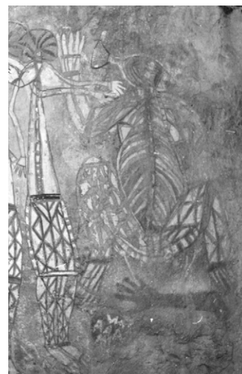
Figure 12. Close up from the 1968 Brandl photograph showing the now faded female figure at the lower right of the Anbangbang Gallery main panel (Eric J. Brandl 1968, courtesy of AIATSIS).

painting at Mount Borradaile (see Roberts and Parker 2003: 82–83) and (b) a bark painting by Nayombolmi (possibly painted together with Djimongurr) while they were living at Nourlangie Safari Camp. Further details pertaining to these very complex and interrelated Ancestral Beings and their stories are given by Chaloupka (1993), Taçon (1989a), Taylor (1996) and Gunn and Whear (2008).