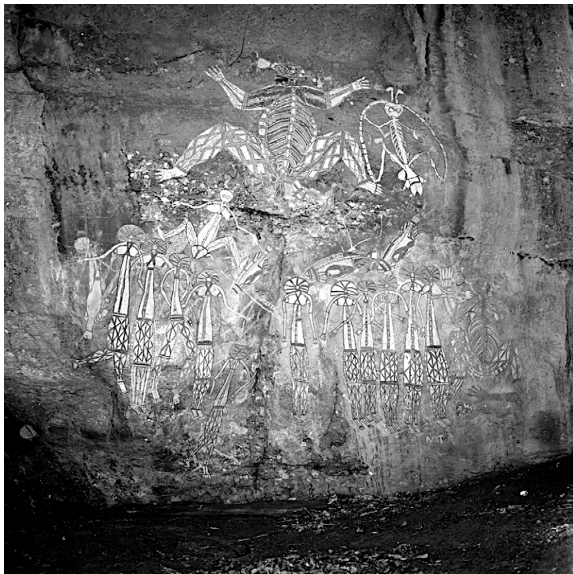
Figure 4. Anbangbang Gallery in 1968 photographed by Eric J. Brandl (Eric J. Brandl 1968, courtesy of AIATSIS).

in September of 1963 and her photographs record the gallery before it was painted for the last time (Lhuedé 2012: 17, 19). Sometime after September of 1963 the new paintings were created, probably during the wet season of 1963/64, certainly before 1965 when Edwards visited the site. As far as we know, Edwards (1974) was the first non-Indigenous person to have recorded the substantial new additions to the Anbangbang Gallery, with Eric J. Brandl (MS 1348a) following soon after (Fig. 4).