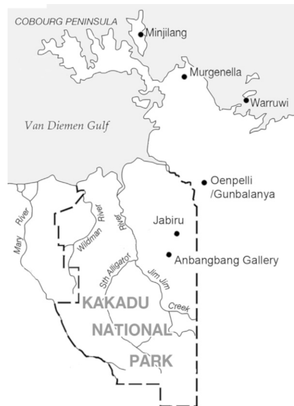
Figure 1. Map illustrating the location of Kakadu National Park and Anbangbang Gallery (Map by SKM).

First-hand accounts of rock art being created are extraordinarily rare. By the time anthropologists and other researchers began asking questions about rock art in Australia, most of the artists had passed away and others may have simply been unwilling to discuss their work. While rock art is occasionally still created in western Arnhem Land, it is very rare and sporadic (e.g. Taçon 1992; Munro 2010; Taylor 2016, 2017). Josie’s new insights are, therefore, particularly important for