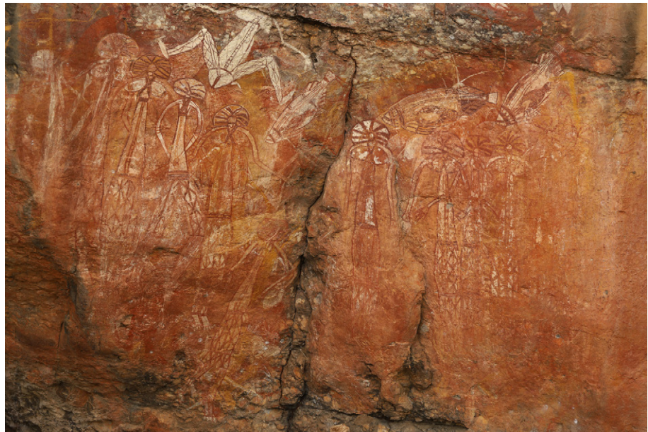
Figure 14. The series of human-like figures painted in 1963/64 by Nayombolmi and Djimongurr.

The 'breast girdles' are also a key feature with Hodgson (1995: 83) noting in her review of material