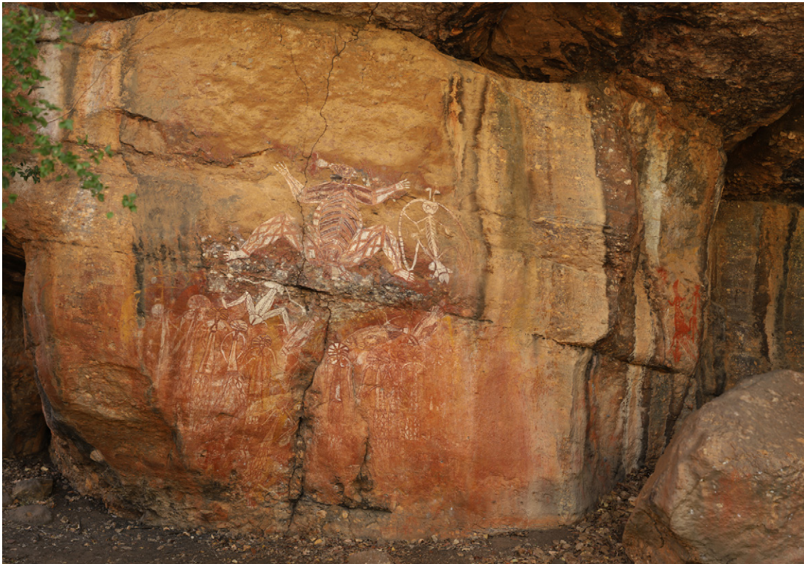
Figure 2. The main panel at the Anbangbang Gallery.